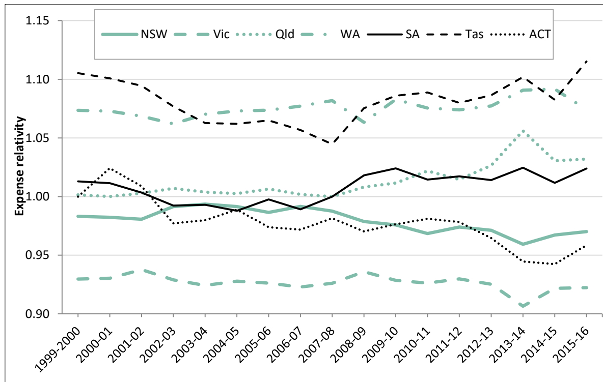
Figure 3 Ratio of assessed to average expense by State and year, 1999-00 to 2015-16

Note: The year label refers to assessment years. The chart shows the last assessment year for various inquiries. So, 2008-09 is the last assessment year of the 2010 Review, 2015-16 is the last assessment year of the 2017 Update.