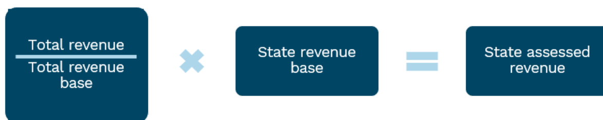
Figure 2 Calculating assessed revenue