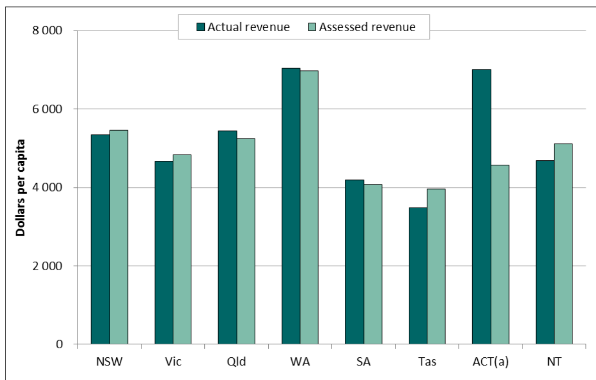
Figure A-1 Total actual and assessed revenue per capita, average of 2014-15 to 2016-17

(a) The reason the ACT is different from other States is that the ACT does not have a separate local government sector. Its actual revenue includes $452 million ($1 112 per capita) in municipal rate revenue, revenue that is not included in other States' actual revenues. The ACT's municipal rate revenue is assessed EPC, which means it does not affect its GST share.